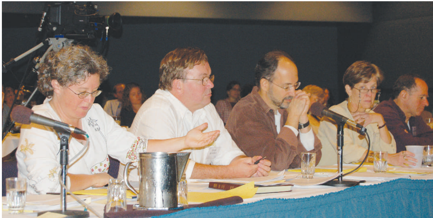
Grad idol: a multidisciplinary panel of experts questions the students about their research proposals.

services, such as fresh water, that the communities rely on. New housing developments are being designed and marketed as having a reduced environmental footprint, although there is no comprehensive study of the true environmental impacts of individual developments. So the group proposed a comparative study between conventional and tightly grouped 'cluster' housing communities.